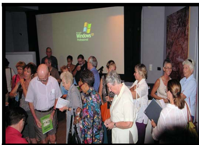
The queue to buy the book