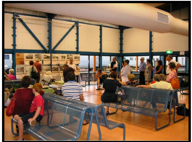
The launch was held in the station waiting room