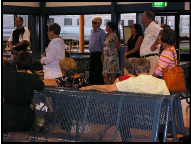
The audience with the Ghan in the background