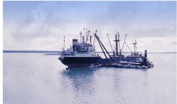
Seisho Maru in Darwin Harbour being loaded by Kitsurin-go, with tug boat Koei Maru alongside.