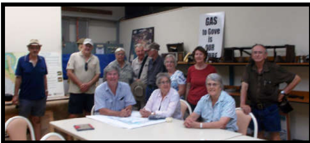
Our group at the Arnhemland Historical Society headquarters, Gove control tower site