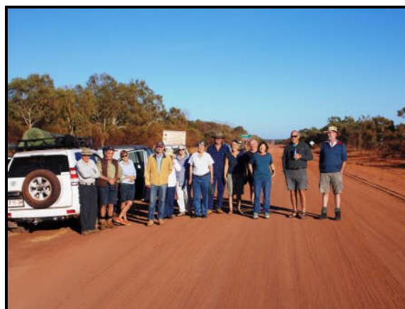
A group photo on the Buchannan Highway