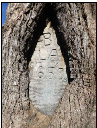
Surveyor Scandrett's inscribed tree at Murrnaji waterhole, 1926.